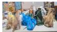
Vittles for Vets