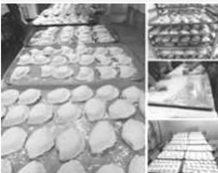
A few of our brothers assist with the making of pierogi for sale during the holidays and our annual Pierogi Festival. "Smaczne"