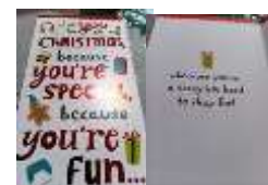
Christmas Greetings for the Vets at VRH